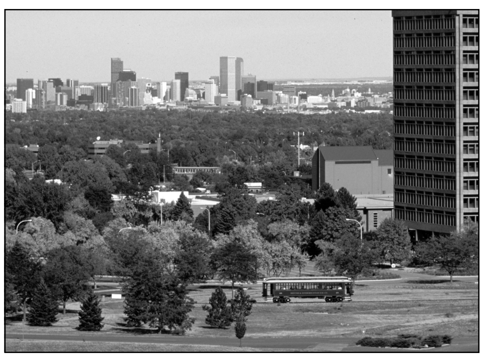
Off in the distance, the City of Denver seems to beckon as No. 25 pauses near the end of the only remaining track of a once extensive system of Denver Federal Center trackage.