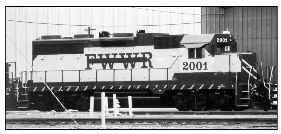
Fort Worth & Western RR was a GP-35, now upgraded by Omnitrax, Loveland, CO, to a GP38-3. Unit was at BNSF's Denver Diesel Shop, 11/3/00. Unit went south via BNSF to Fort Worth, TX. FWWR 2001 is a rebuilt GP35, ex OMLX 2006, exx Long Horn RR 2006, nee DRGW 3050. The frame number is 7782-1.

The Tennessee Pass railroad corridor has been an area that county officials, as well as public and private groups, have been eyeing with interest. Groups have been curious to see if Union Pacific is willing to allow uses such as a hiking and biking trail or the start of a light rail line from Gypsum to Minturn.