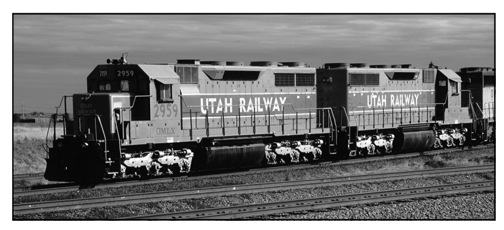
Omnitrax Leasing (OMLX) leased Rock & Rail (Parkdale, CO, on the UP's Royal Gorge Route) Utah Railway lettered and painted SD-35's 2959 & 3108. They started making unit rock train runs north from Pueblo to Peter Kiewit at Aurora, CO, Mesa Siding in late October 2000. OMLX 2959 and 3108 were at Peter Kiewit Siding in Aurora along Smith Road on 10/29/00.

City) about 4:00 PM. – The Colorado Zephyr