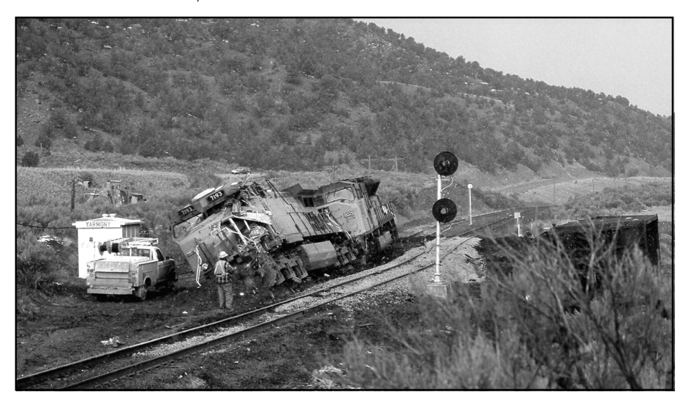
The signal crews are testing the eastbound signal for West Yarmony to be sure it is in working order. The conductor's side of UP 7193 is shown.