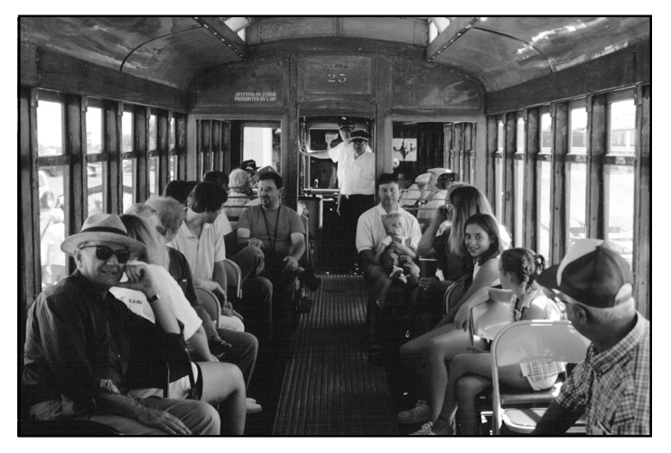
People of all ages add life to a full car as No. 25 prepares for another departure from Building 78 on September 10.